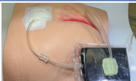
5. Connection of drain to PLV universal adapter, opening of front side of universal adapter for connection of suction connector and then activation of vacuum.

Further treatment: The closed vacuum therapy system should be replaced after 3-5 days. Depending on the findings in the wound cavity, the treatment can be continued with fresh foam or the wound closed without foam.