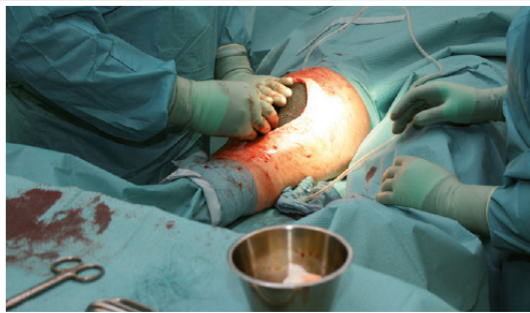
3. Folding of the foams and introduction of the set into the wound cavity. Lateral routing out of drain with help of trocar.