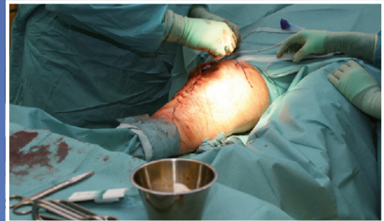
4. Closure of wound and sealing with film, hydrocolloid or foam dressings. Removal of trocar from drain.